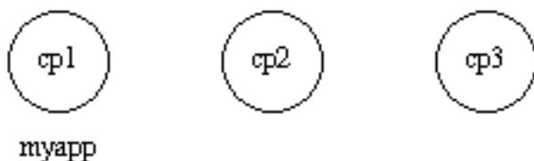
Figure 9.1: Application myapp - Situation 1

When all nodes are operational, myapp can be started. This is achieved by calling application:start(myapp) at all three nodes. It is then started at cp1 , as shown in the following figure: