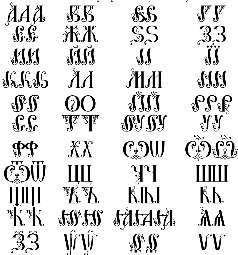
Table 9: Character shapes provided by Pomorsky Unicode

The base form, the “simple” form, and any stylistic alternatives of a character are demonstrated in Table 9.