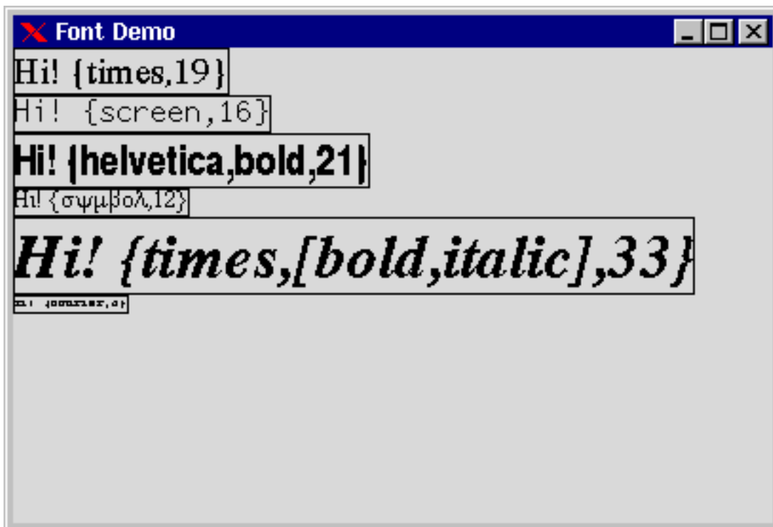
Figure 5.1: Font Examples

When programming with fonts, it is often necessary to find the size of a string which uses a specific font. {font_wh,Font} returns the width and height of any string and any font. The following example illustrates its usage: