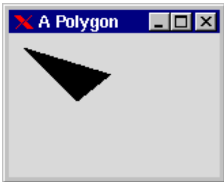
Figure 8.10: Canvas Polygon Object

gs:create(polygon,Canvas, [{coords, [{10,10},{50,50},{75,30}]}]).