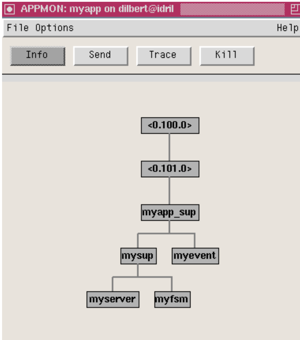
Figure 1.2: The Application Window.

The application can be shown either as a strict supervision tree, or as a process view with all linked processes. In supervision mode, the tree-gathering and -building algorithm assumes conformance to the OTP design principles.