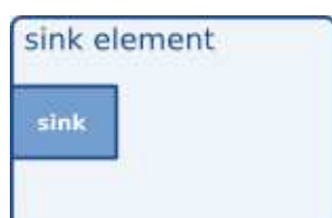
Figure 5-4. Visualisation of a sink element

Sink elements are end points in a media pipeline. They accept data but do not produce anything. Disk writing, soundcard playback, and video output would all be implemented by sink elements. Figure 5-4 shows a sink element.