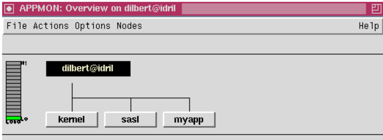
Figure 1.1: The Main Window.

The load meter shows load measured as processor time, or as the length of the ready queue.